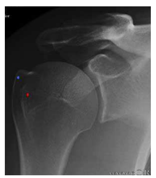
NORMAL SHOULDER XRAY

For some patients, this process can be functionally limiting and painful, and for others this does not cause too much of an issue. When your pain and function begin to cause a <u>decrease in the "quality of</u> life", that is when it is time to consider shoulder replacement surgery and discuss it with your physician.